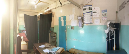
Above: The current state of the Accident and Emergency room at Mangochi District Hospital

The Department of Family Medicine aims at improving the quality of medical service and medical education. of Mangochi. As you can see from picture above the A&E room is in need of improvements.